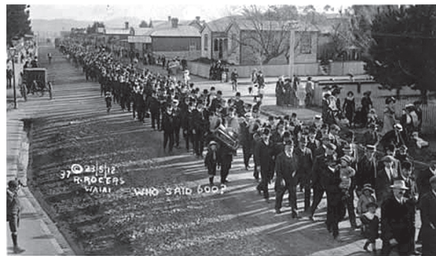
Waihi miners march, May 1912. The I.W.W. was particularly vocal in their support of the miners, calling for a general strike in solidarity and advocating a campaign of sabotage.

Any time agreement which makes a strike a breach is nothing but a promise, on the part of the organisation which is a party to it, to scab on the